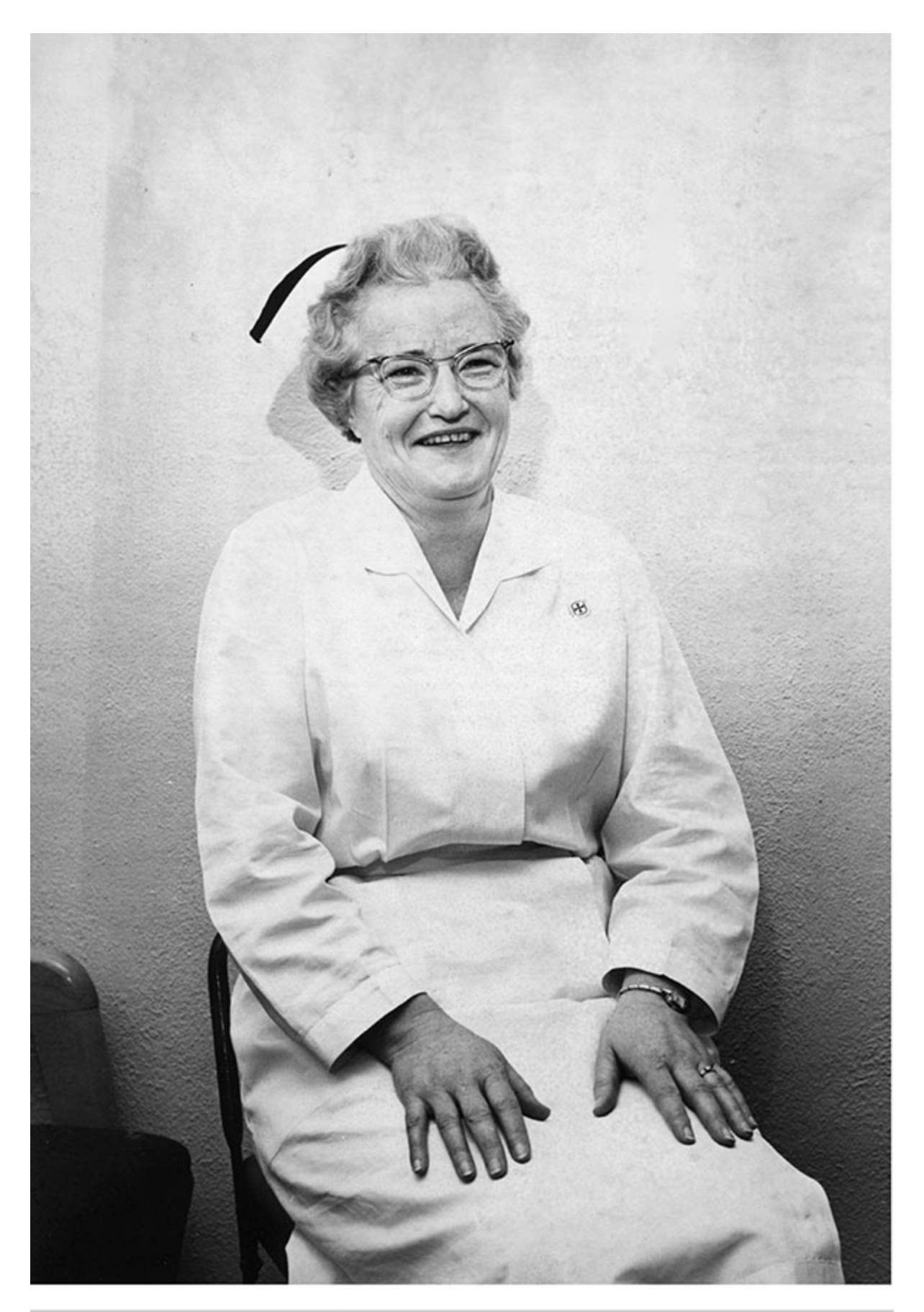
Property of Appalachian State University